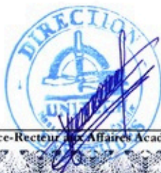
Le Vice-Recteur aux Affaires Académiques